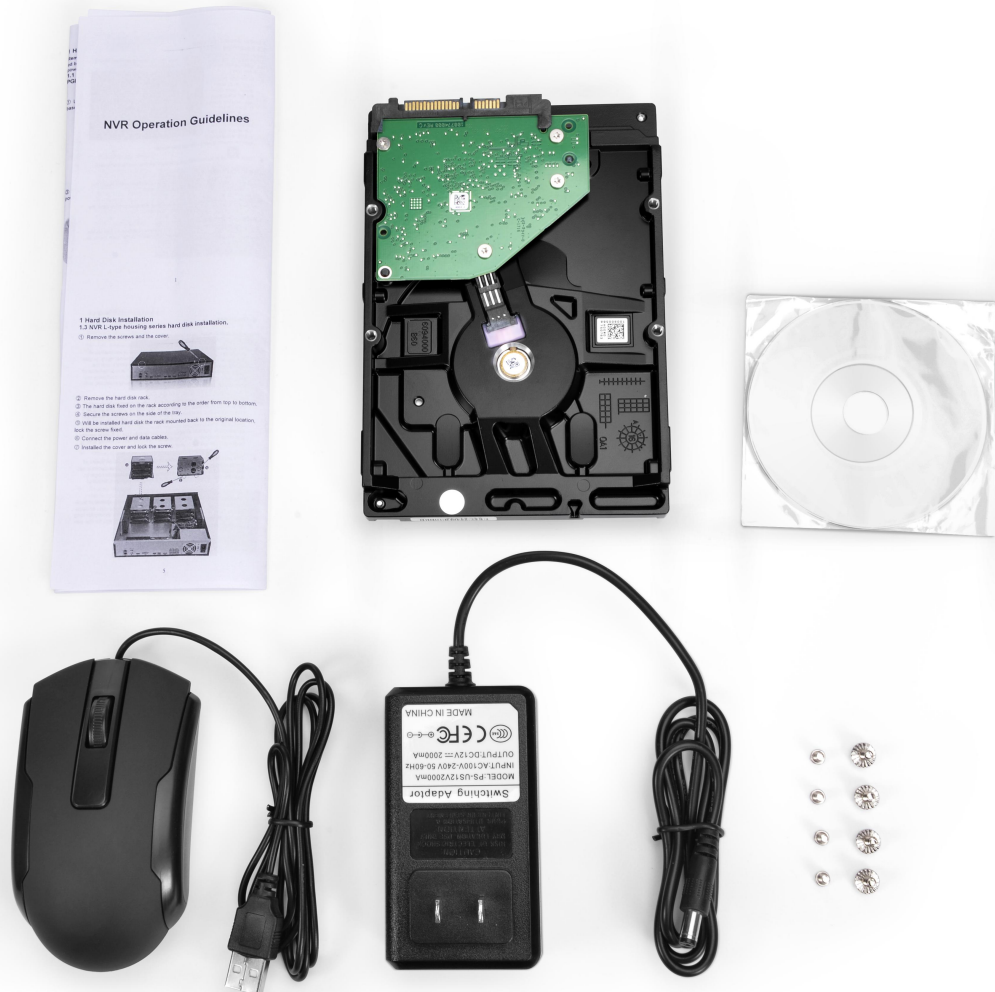
Figure 2- FS-NVR-9CH Accessories