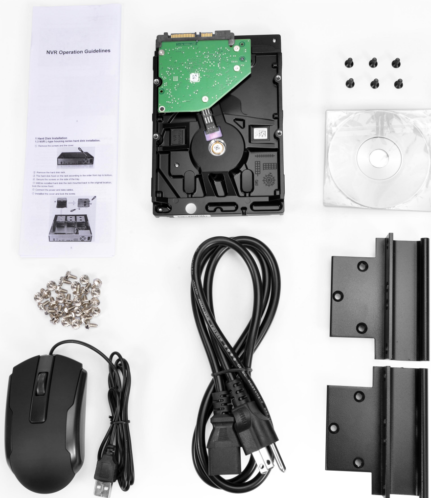
Figure 2- FS-NVR-64CH Accessories