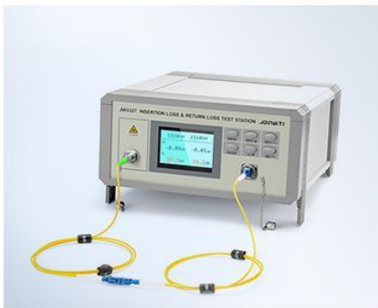
Insertion Loss Testing