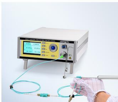
Return Loss Testing