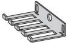
Cable Manager x1