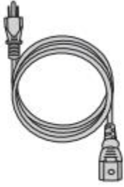
Power Cord x2