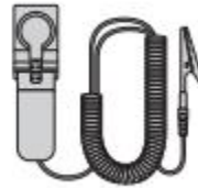
ESD Wrist Strap x1