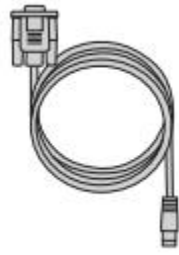
Console Cable x1