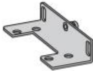
Mounting Bracket x2