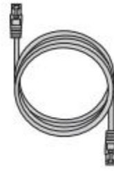
Ethernet Cable x1