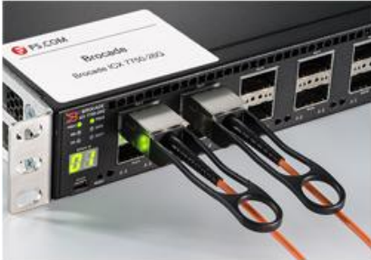
Brocade ICX 7750-26Q