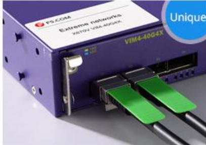
Extreme Networks X670V VIM-40G4X