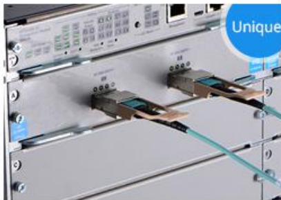
HP 5406R ZL2 V3(J9996A)