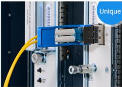
Cisco ASR 9000 Series(A9K-MPA-1X40GE)

The original switches could be found nowhere but at FS.COM test center, eg: Juniper MX960 & EX 4300 series, Cisco Nexus 9396PX & Cisco ASR 9000 Series, HP 5900 Series & HP 5406R ZL2 V3(J9996A), Arista 7050S-64, Brocade ICX7750-26Q & ICX6610-48, Avaya VSP 7000 MDA 2, etc.